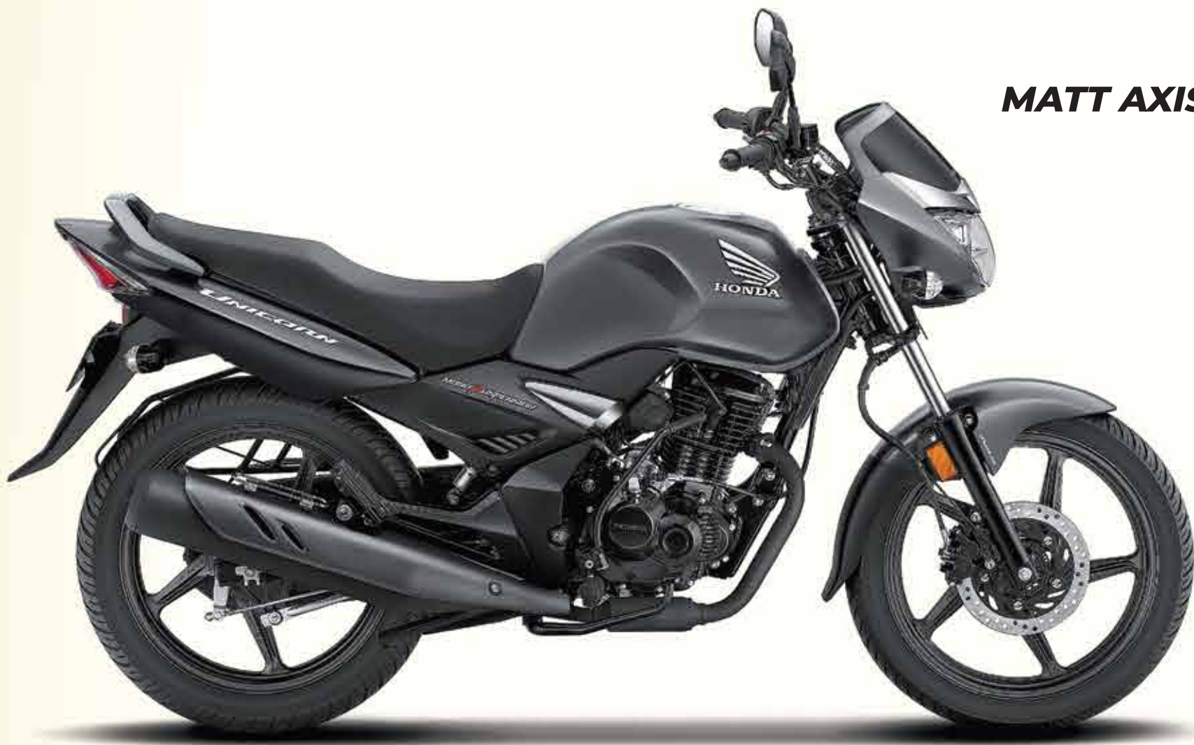
MATT AXIS GREY METALLIC